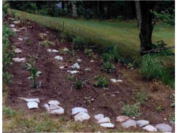
1995 - Here's a view from the top of the hill showing where I made my terraced gardens on the hill to the left of the tree in the previous photo.