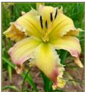
*OctoNessie (Raised by Wolves X Unk - Probably Heavenly New Frontiers)