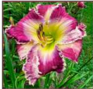
*Forever A Free Press [(Blue Eyed Susan X Nordic Soul) X (Unk X Ultimate Blush)]