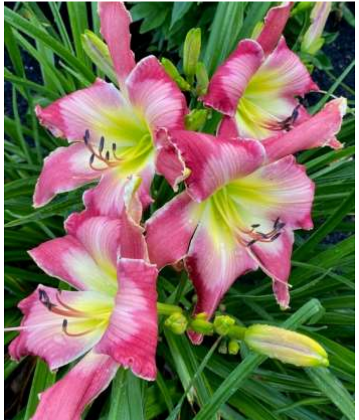
1ST Place-Clump and Cluster Category-'No Boys Allowed'