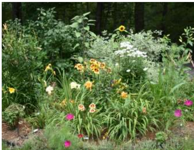
Garden in summer at driveway