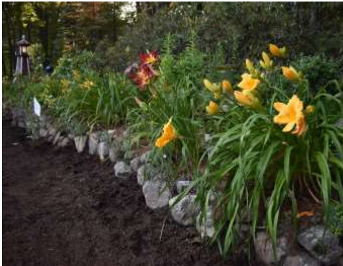
Garden in Summer – at Garden Entrance