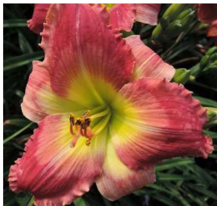
Alpha Angelic Passion (Stanton, 2021)

height 33 inches (84 cm), bloom 6 inches (15 cm), season MLa, Semi-Evergreen, Tetraploid, 20 buds, 3 branches, Red, extending to near peach edge, pink watermark, bitone.. ( Truly Angelic × Passion's Promise )