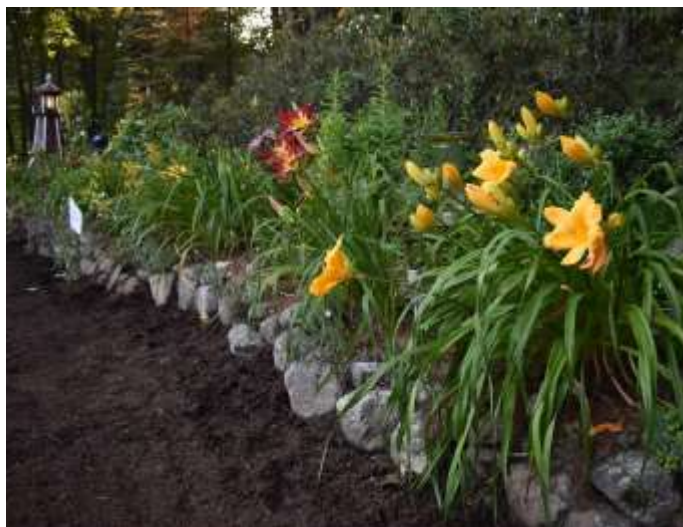
Garden in Summer – at Garden Entrance