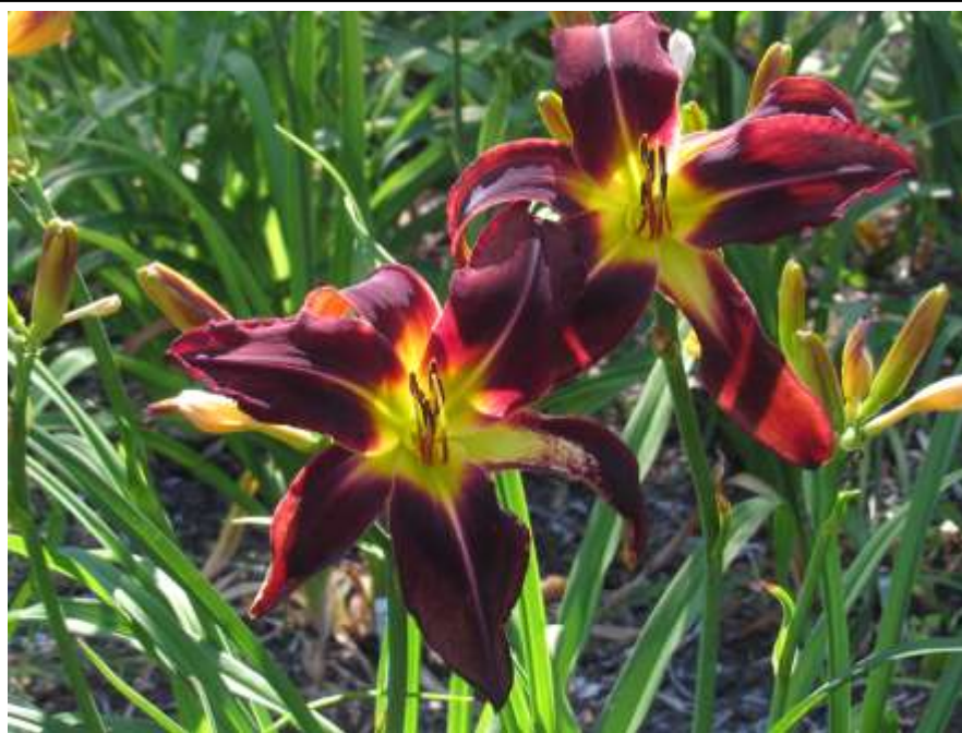
Blackbird Calling (Church, 2018)

height 34 inches (86 cm), bloom 6 inches (15 cm), season M, Semi-Evergreen, Tetraploid, Fragrant, 18 buds, 3 branches, Yellow with faint, peach tint beside lighter midribs, more peach tint on sepals, bright green throat, yellow fringed edge on petals.. ( Glowing Quasar × Footlong )