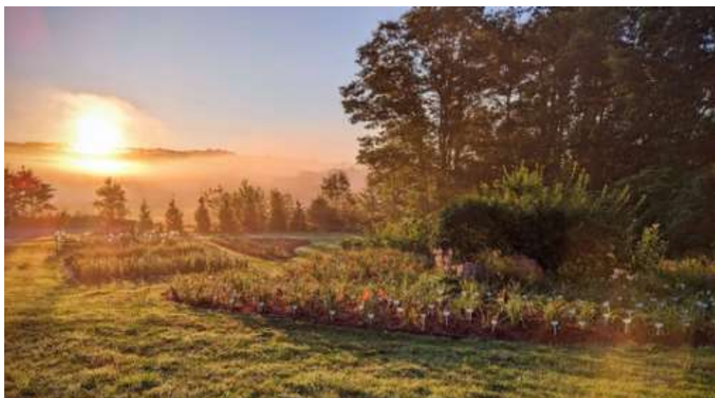
1ST Place-Landscape Category - Dooley Gardens, Limerick, Maine

Our website www.nedaylily.org will be updated with details about the meetings when they become available. "Like us" on Facebook - New England Daylily Society – NEDS to stay informed of upcoming events.