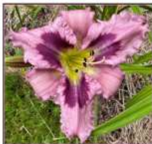
*Accomplishing Mia (Maureen Faber X Tol of Gascone)

EDITOR'S NOTE: This article was written by artificial intelligence (AI). Can we trust AI? What do you think?