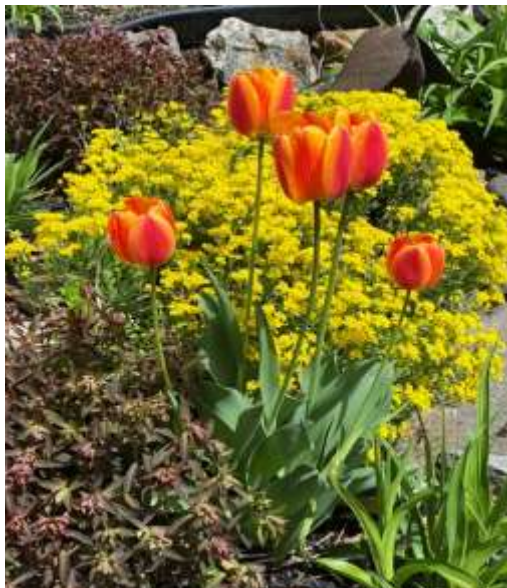
2023 Spring - My garden starts the blooming season with lots of spring flowers like daffodils, tulips, muscari and in early summer lilies. I plant over 500 tulips in autumn, when dahlia tubers are dug out for overwintering. I spray castor oil mix in each hole to deter voles from eating them all. It seems to work quite well.