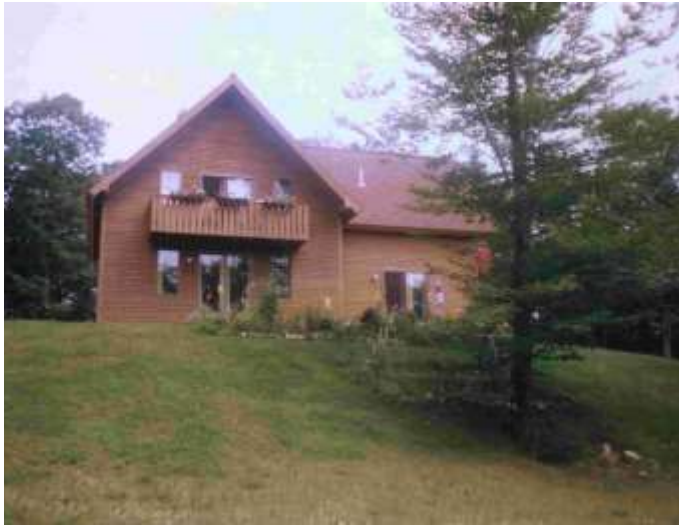
1992 - My husband's famous words " The hill is too steep to cut the grass-do something with it " prompted me to convert the hillside into a terraced garden.

Last year, in fall of 2023, I decided to fill out the application for an AHS display garden and am thrilled that it was approved. I'm looking forward to many visitors and sharing my creation that has been