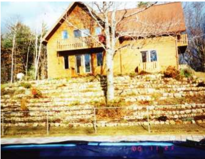
2000 - After a heavy rain fall, a mud slide went into the pool, which took three days to clear the water. This event prompted me to build little stone walls with the numerous stones on my property. The garden grew slowly over the years, adding on sections on each side, including a water fall.