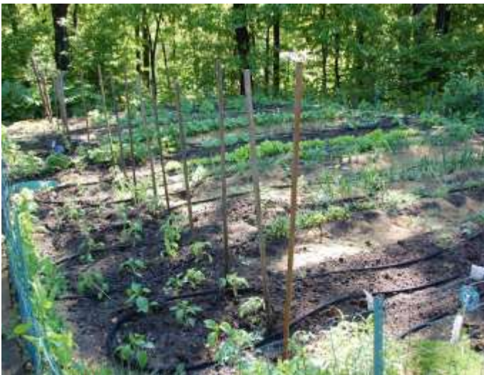
2010 vegetable garden

In addition to the hillside garden are many more flower beds and a big vegetable garden. Fighting deer and rabbits is an ongoing battle. In my vegetable garden I grow tomatoes, peppers, eggplant, beans, lettuce, cucumber, carrots, beets, asparagus, onions, garlic and potatoes.