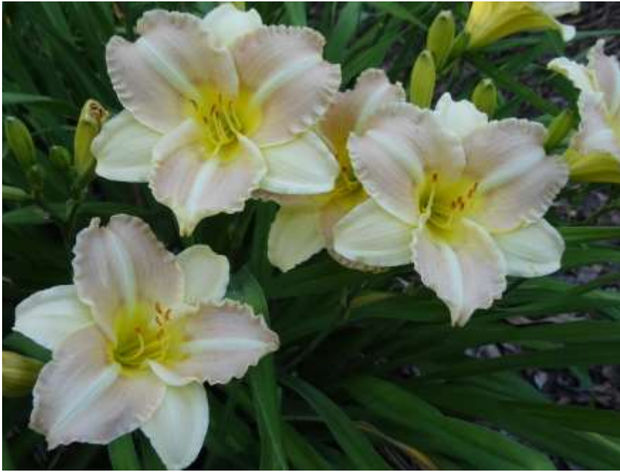
Cobbs Hill Meditation (Zettek, 2016)

height 28 inches (71 cm), bloom 4 inches (10 cm), season M, Evergreen, Diploid, 12 buds, 3 branches, Pale lavender pink bicolor with creamy pale sepals, cream midribs and pale edge, yellow throat, ruffled. (sdlg × Royal Jester)