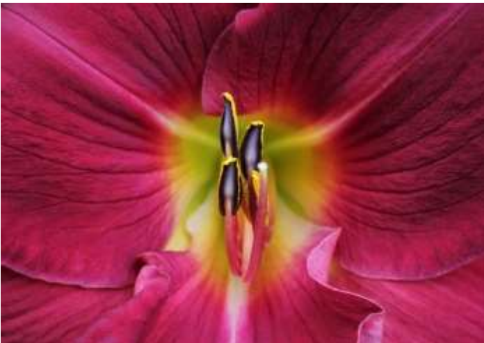
1ST Place-Single Bloom Category - 'Charles Johnston'