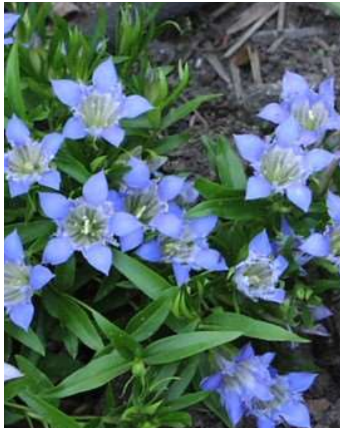
Gentian paradoxa 'Blue Herold'