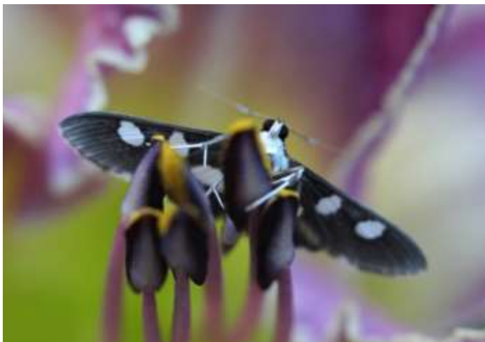
1ST Place-People, Pets & Wildlife Category - Seedling with Moth

The landscape category winner is on the next page. Our thanks to all who contributed photos to the delight of those who attended the meeting. It was a great way to spend a winter Saturday!