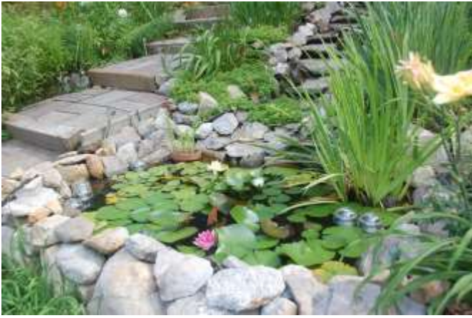
2010 - I added a small pond at the bottom of one side of the hill. It is now often frequented by at least 2 or 3 frogs that have taken shelter among the water lilies.