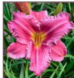
Carmine Miranda Rights (Mill River Masque X Unknown)