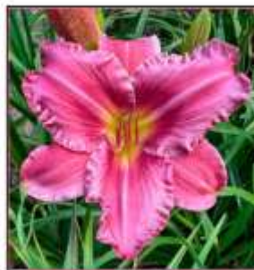
Carmine Miranda Rights (Mill River Masque X Unknown)