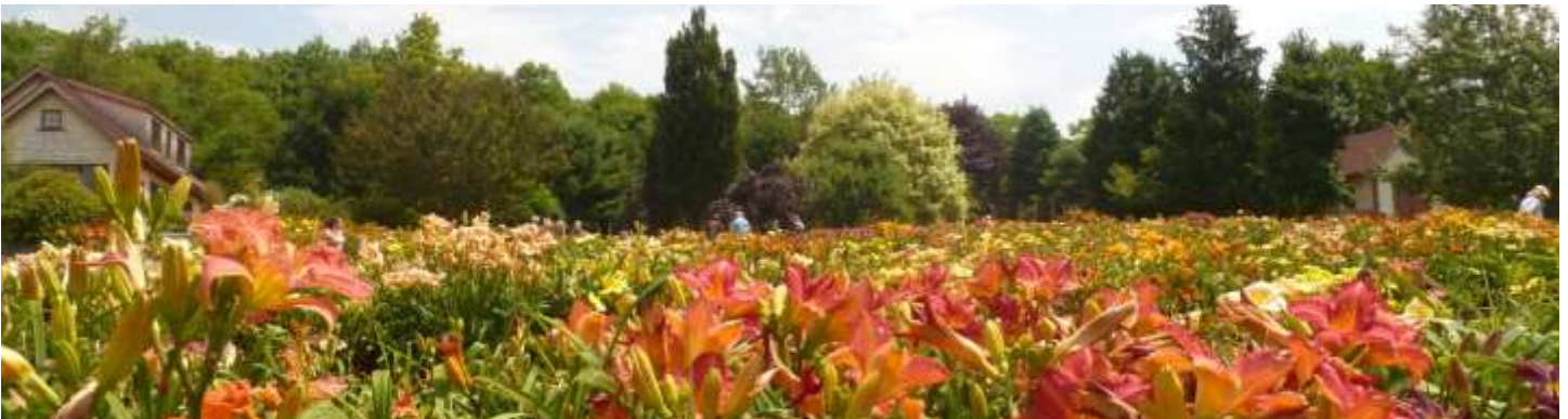
Barred Owl Daylilies in Otisfield, Maine