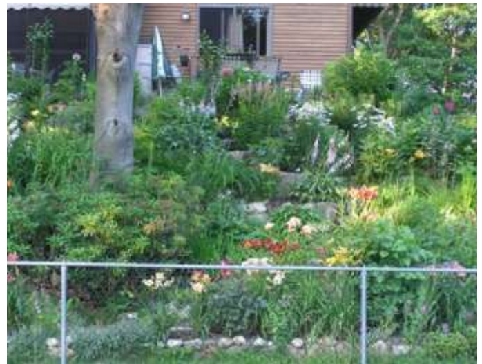
2005 - When my mother-in-law gave me a gift certificate to a daylily farm on Cape Cod, I was hooked. I could not believe the large varieties of daylilies. A visit with my garden club to Tower Hill Botanic Garden during a NEDS Daylily Exhibition completed the spark of my new passion. I proudly came home with one bag of leftover daylilies for $10.00 and was