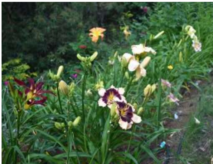
Garden in summer along property edge