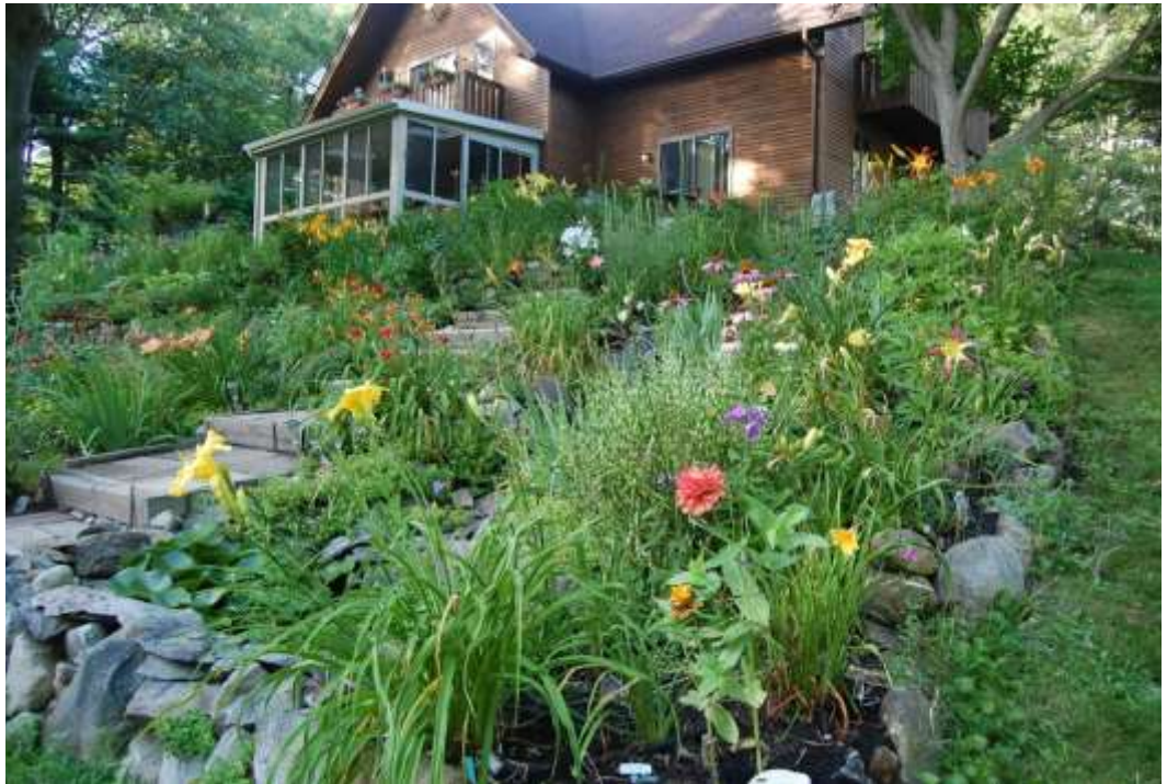
2018 - We replaced our screen house with a permanent sun room. We are able to enjoy the sounds of summer and the view to the garden every day.