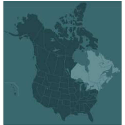
ADS Region 4 spans states and provinces in US and Canada. They are shown in the lighter color on the map above.