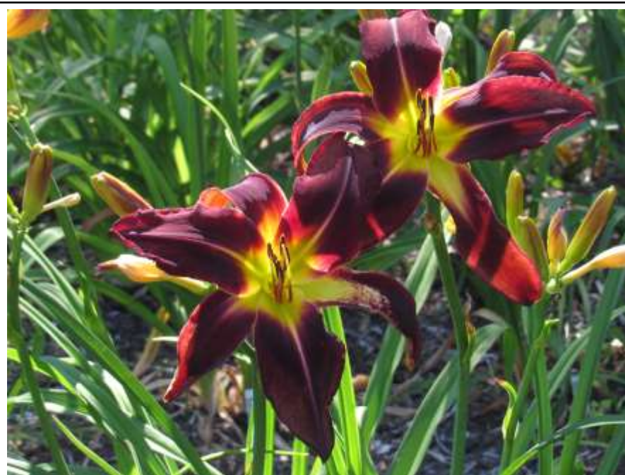
Blackbird Calling (Church, 2018)

height 34 inches (86 cm), bloom 6 inches (15 cm), season M, Semi-Evergreen, Tetraploid, Fragrant, 18 buds, 3 branches, Yellow with faint, peach tint beside lighter midribs, more peach tint on sepals, bright green throat, yellow fringed edge on petals.. ( Glowing Quasar × Footlong )