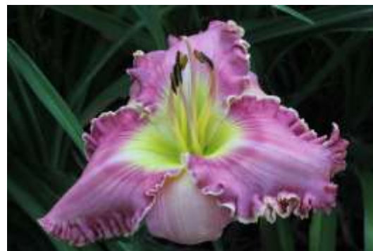
Above, Single or Multiple Blooms 'Sheza Heartbreaker' (Harry, 2008)