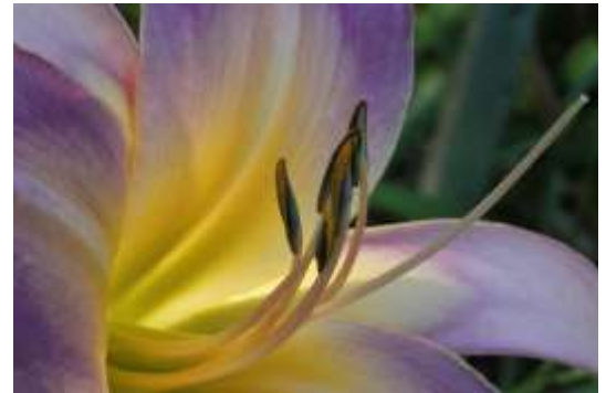
Above, Artistic Close-up 'Kyoto Swan' (Moldovan, 2001)