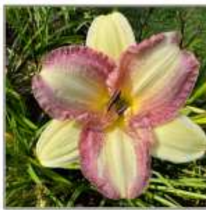
Parasol Princess (America's First Peoples X Unknown)