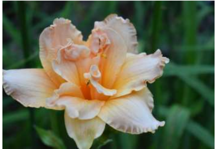
1ST Place-Seedling Category - Lis Murphy Seedling