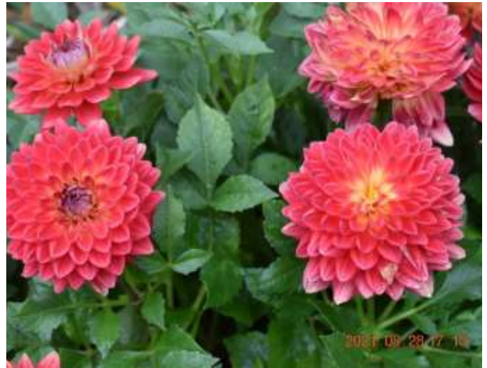
2021 Dahlia 'La Bella 'Maggiore Fun Flame'

Another favorite flower in my garden are dahlias. They usually bloom when most of the daylilies are done blooming. I plant the tubers in late spring when the spring flowers have completed their show. Tulip bulbs are taken out and dahlia tubers are planted in their place.