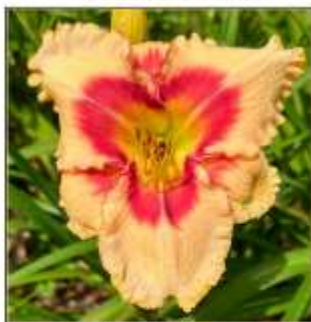
*Naught Fooled Anymore (Abilena Lillian X Carnival Dream)