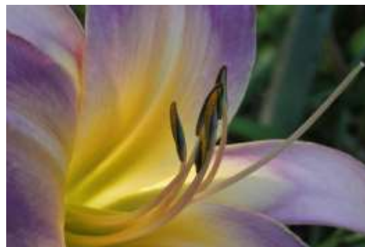
Above, Artistic Close-up 'Kyoto Swan' (Moldovan, 2001)