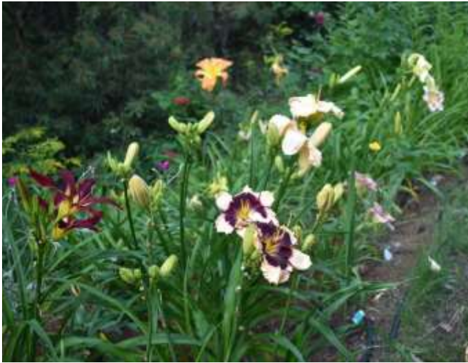
Garden in summer along property edge