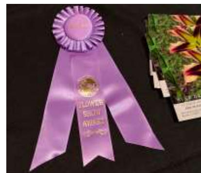
Linda Hunter (Left photo) and Bob Musson (center photo) at the CDS booth at the Hartford Flower Show

Connecticut's display. We won an honorable mention ribbon. Volunteering is a great deal with free entrance plus 4 hours of parking! Estimates of attendees were in the tens of thousands. It is the first major flower show in the Northeast. Huge numbers of commercial booths with everything from French tea towels to seeds to honey to houseplants. Gardening groups and local landscapers also competed in building small landscape scenes with forced trees, shrubs, and flowers. Very inspiring!