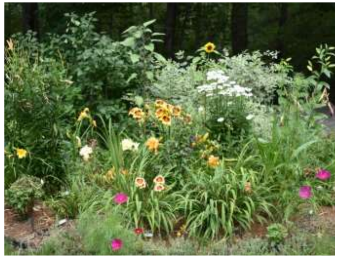
Garden in summer at driveway