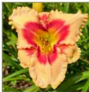
*Naught Fooled Anymore (Abilene Lillian X Carnival Dream)