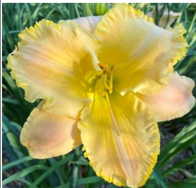
Au Lys du Jour (Pronovost, 2023)

height 33 inches (84 cm), bloom 6 inches (15 cm), season MLa, Semi-Evergreen, Tetraploid, 20 buds, 3 branches, Red, extending to near peach edge, pink watermark, bitone.. ( Truly Angelic × Passion's Promise )